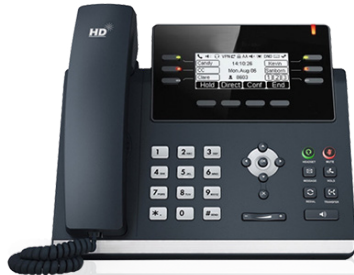
Basic handset $189.95