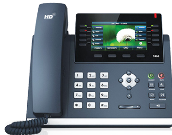
Executive handset $329.95